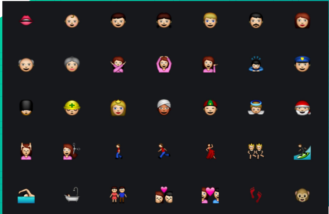
Apple's original emoji keyboard, 2008